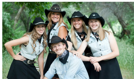
Jackson Family Band & Cloggers, performing over 16 years!

*Reservations are required and Tickets will be presold prior to the event.*